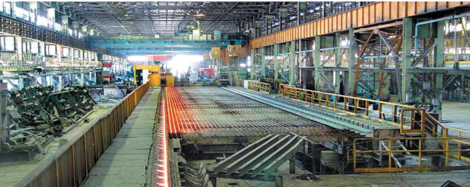
Isfahan Zob Ahan (iron smelting), City of Isfahan